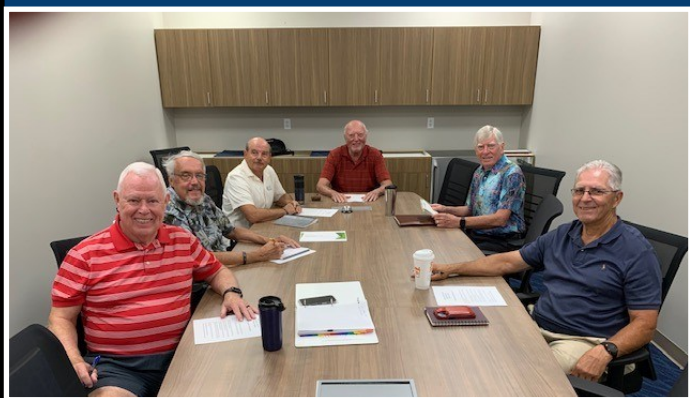
The Elders hold their first meeting in the new Conference Room