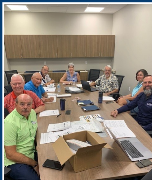
The Building Leadership Team hold their first meeting in the new Conference Room.