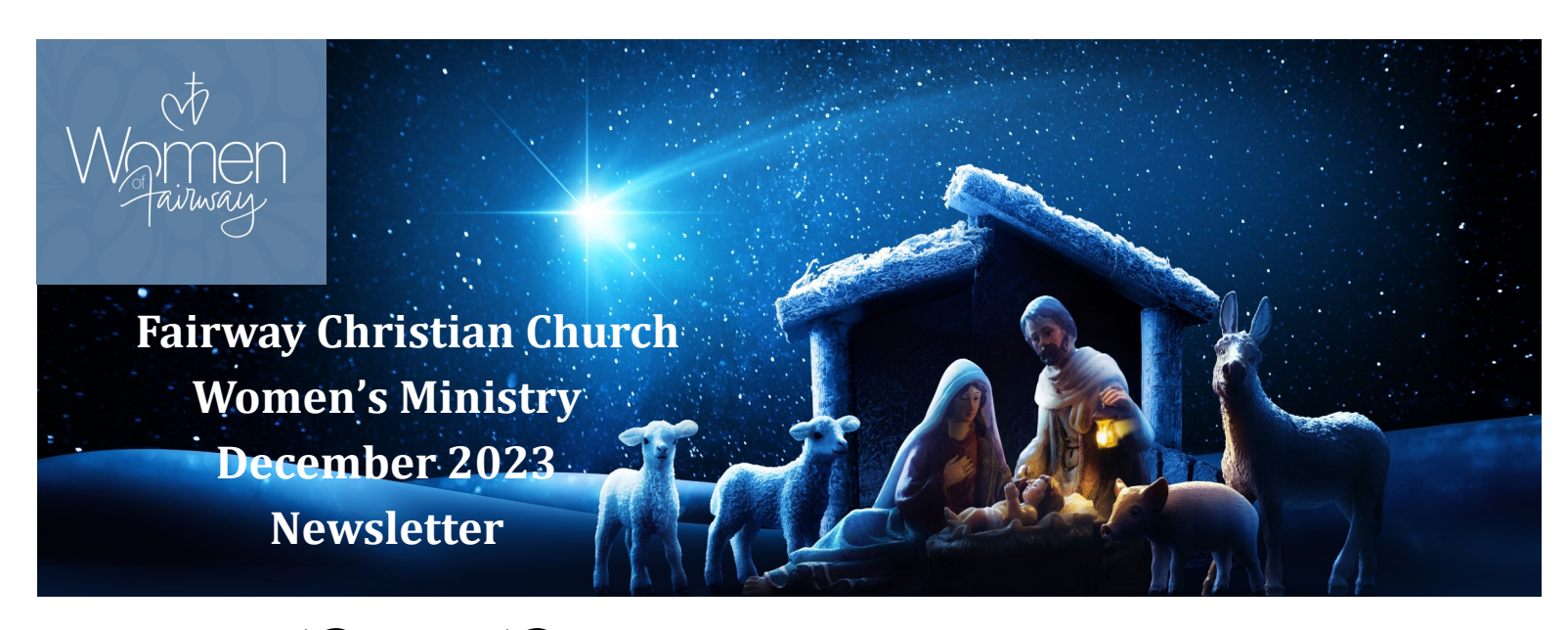
"Glory to God in the highest, and on earth peace, good will toward men." Luke 2:14